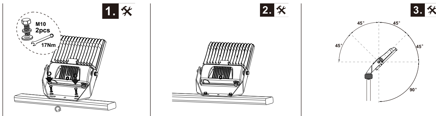
Stainless steel bracket and screw

13. Warranty – In accordance with NSG 's standard terms and conditions of sale, NSG warrant this product to be free from defects in materials and or workmanship for a period as stated below for goods not subject to incorrect installation, maintenance, operation, mishandling, environmental, unauthorised modifications or electrical operating conditions outside the nominated product specification as detailed in these installation instructions. The benefits to you given by this warranty are in addition to other rights and remedies you have under law. Our goods come with guarantees that cannot be excluded under the New Zealand Consumer Guarantees Act. You are entitled to a replacement or refund for a major failure and compensation for any other reasonably foreseeable loss or damage. You are also entitled to have the goods repaired or replaced if the goods fail to be of acceptable quality and the failure does not amount to a major failure.