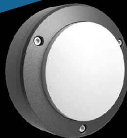
GWL701 WW BK