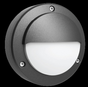
GWL703 WW BK

An elegant out door wall / ceiling mounted light in three variant body types to suit the architecture with 7w LED lamp and integral electronic driver.