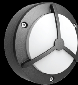
GWL702 WW BK